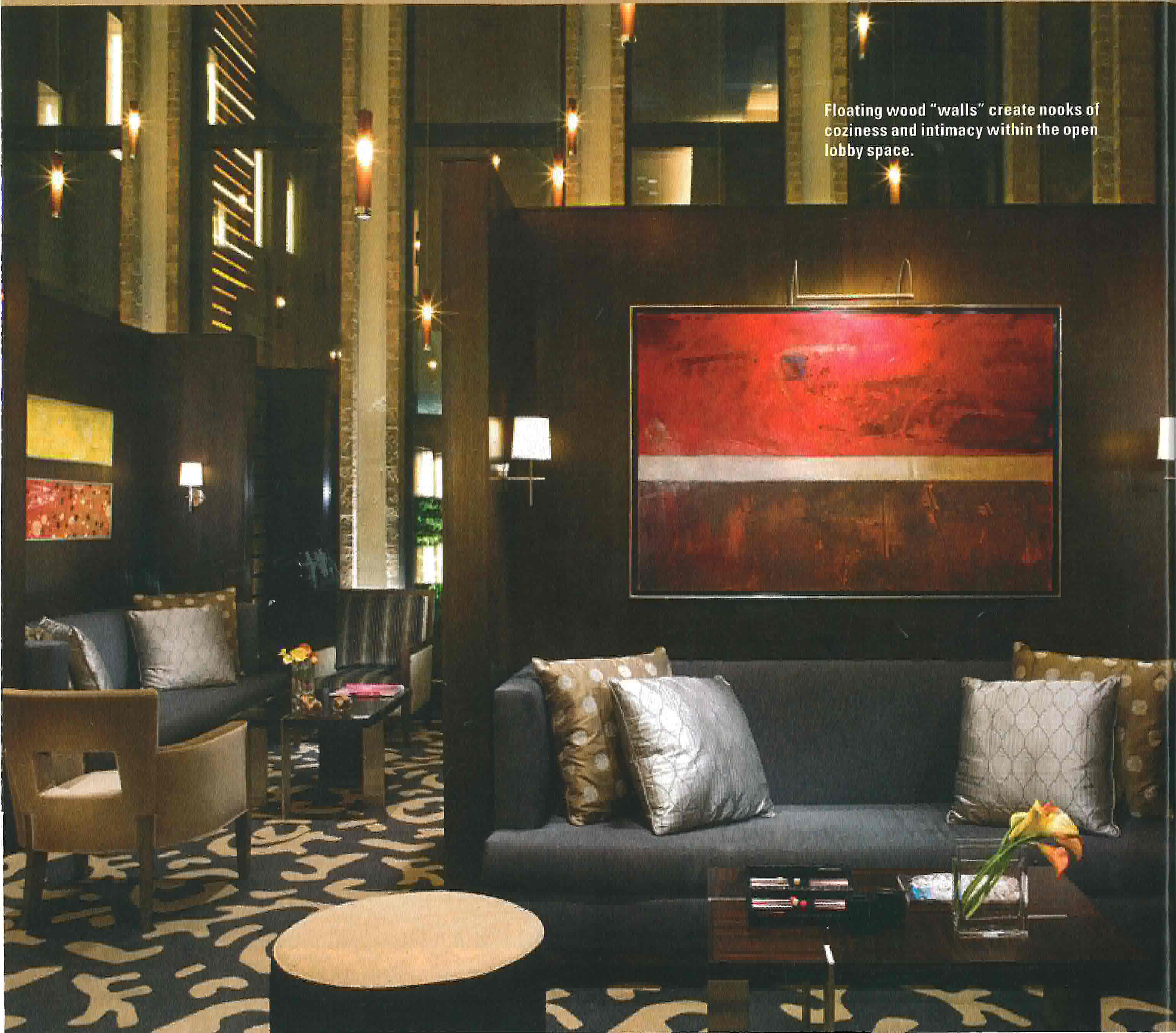
Floating wood "walls" create nooks of coziness and intimacy within the open lobby space.