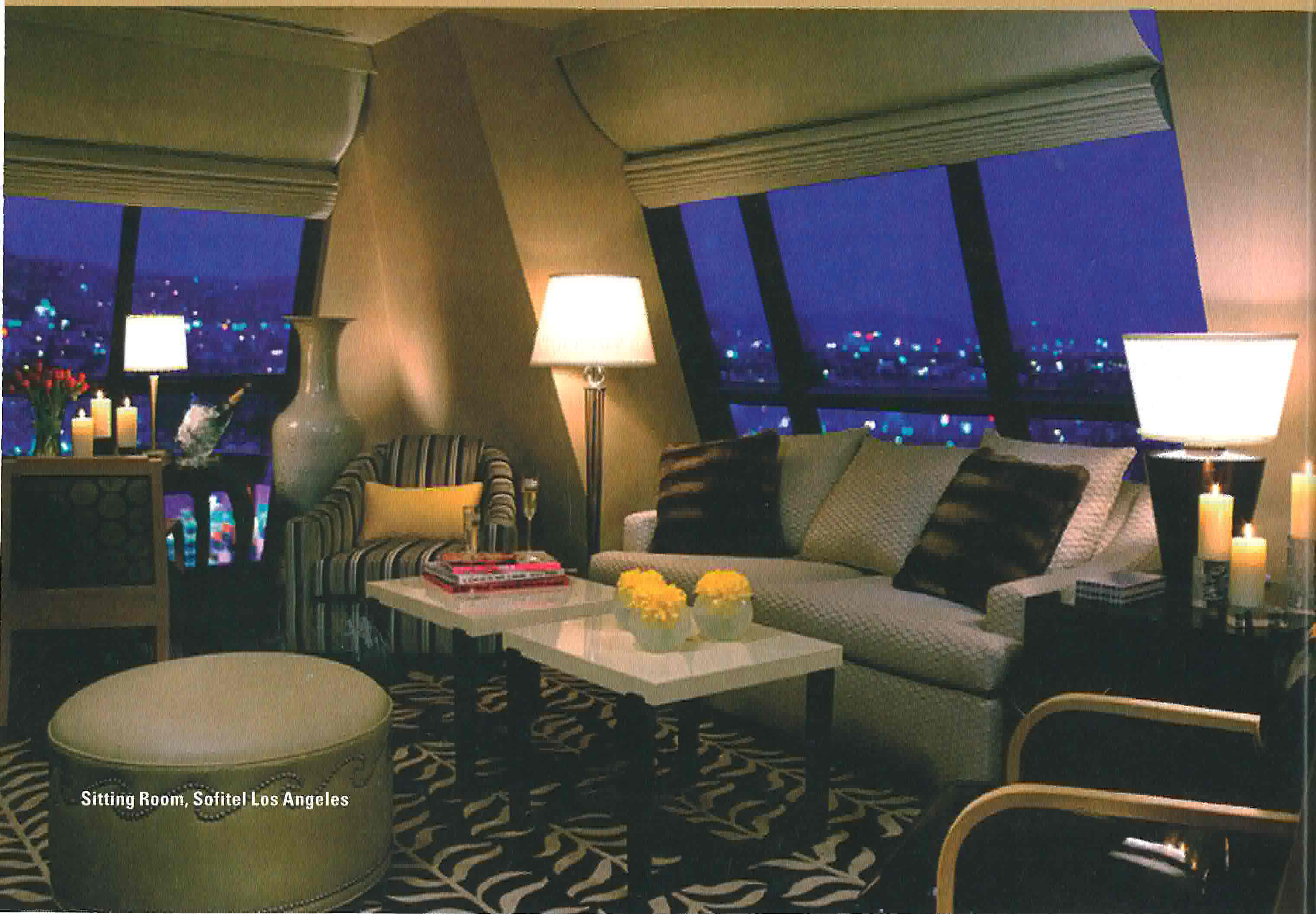
Sitting Room, Sofitel Los Angeles