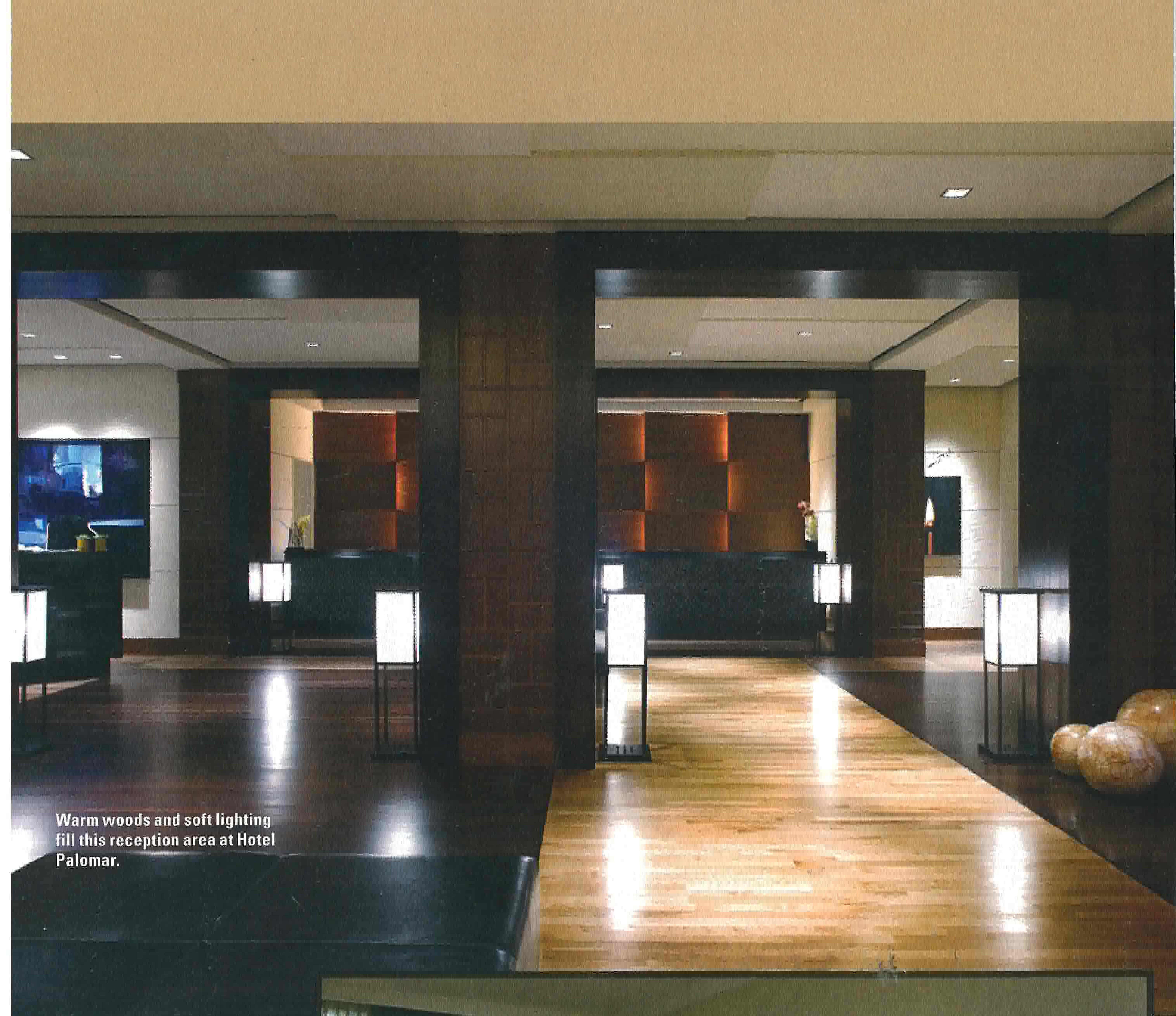
Warm woods and soft lighting fill this reception area at Hotel Palomar.